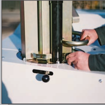
360° Mast rotation.